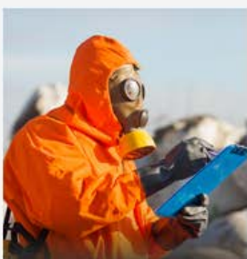
Municipal Worker Safety